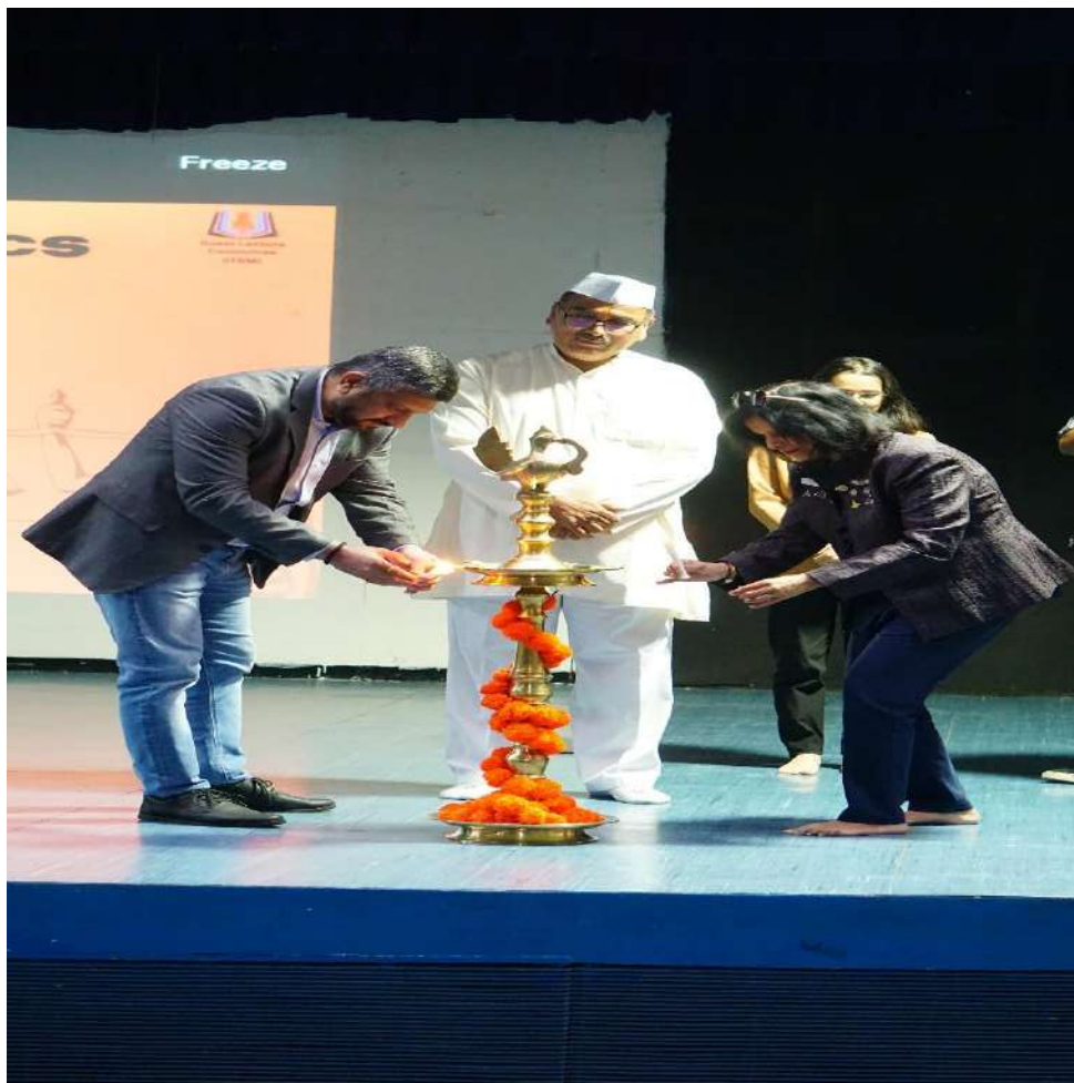
Diya Lighting Ceremony